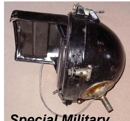
Special Military Lamp with Blackout (001.125), perfect for Sidecars

The metallic blackout driving light was designed to provide a white light of 25 to 50 candlepower at a distance of 10 feet directly in front of the light. The light is shielded so that the top of the low beam is directed at least 2 degrees below the horizon. The beam distribution on a level road at 100 ft from the light is 30 ft wide.