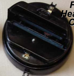
Front Headlight Cover