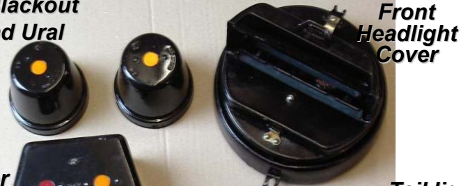
Front Headlight Cover